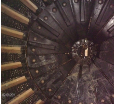
Rubber Ball Mill Liners