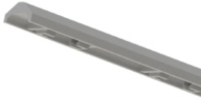
Breaker Block - Hammermill