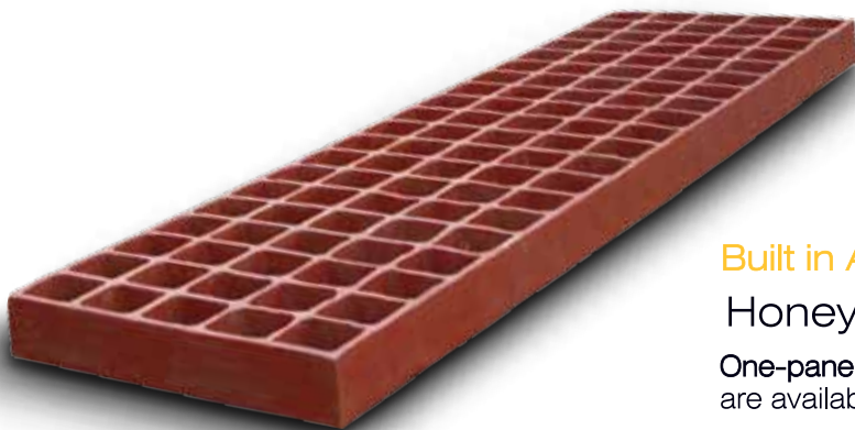
Typical 3' X 10'5" panel