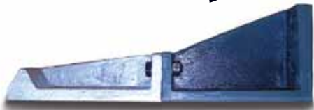
Step 1: Unbolt from Shelf Step 2: Replace Tip Only