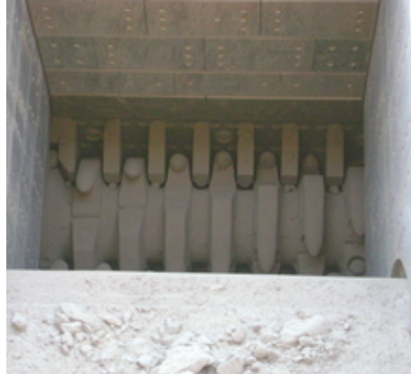
Sizer Roll Crusher