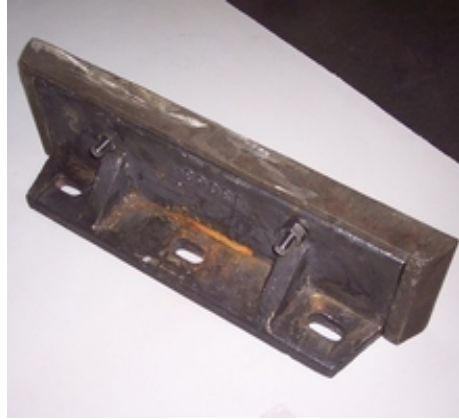
2Piece Side Casting