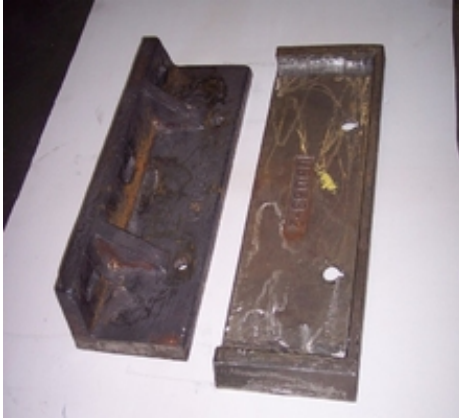
2 Piece Side Casting