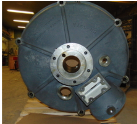
Vsi Lower Gear Housing