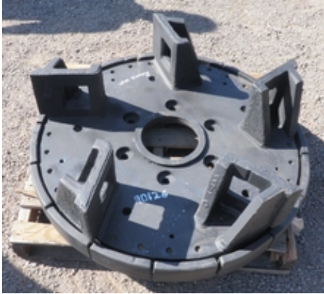
Vert Shaft Imp Tablesbrackets