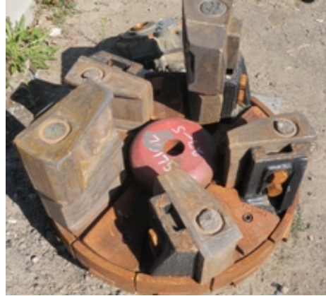
Vert Shaft Imp Tableshoes