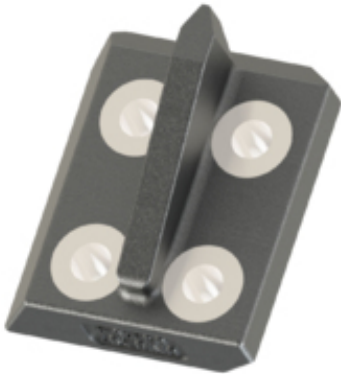
Bracket(2) - Vertical Shaft Impactor