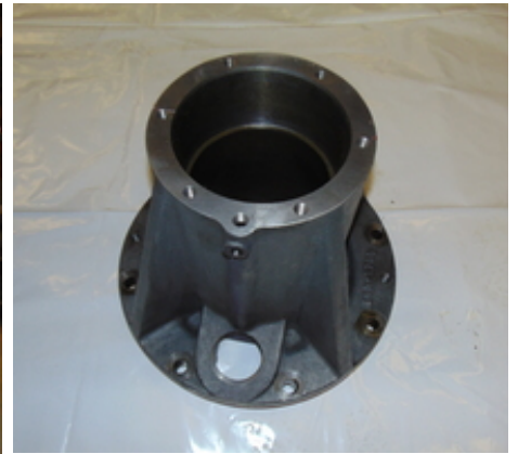
Vsi Pinion Housing