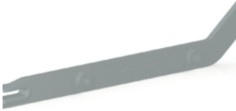
Grizzly Bar - Single Bar Model